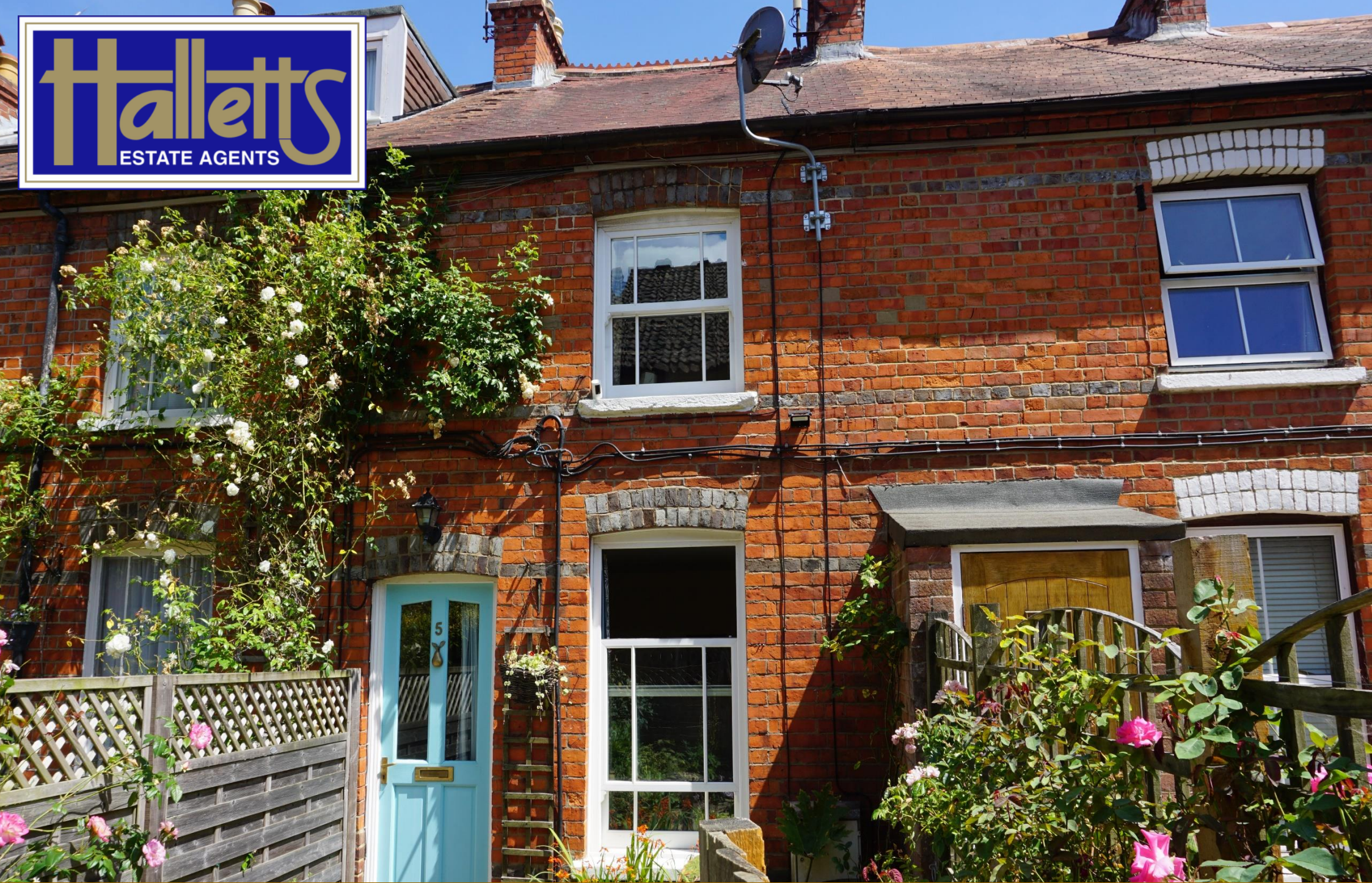
5 Westbourne Terrace Newbury Berkshire RG14 1NR